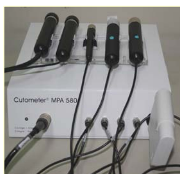
Pro-drugs approach to skin delivery